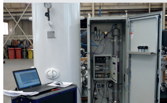
Open Nitrogen Generator